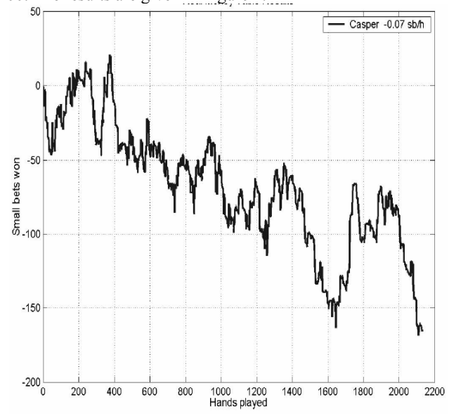
Fig. 2 CASPER vs. Real Online Opponents at the Real Money Tables

CASPER02 (with an increased case-base of 14,000 cases) with hand-picked feature weights that had achieved the best performance at the 'play money' tables was used to play at the 'real money' tables. The betting limit used was a small bet of $0.25 and a big bet of $0.50. CASPER started out with a bank roll of $100. The results are given in Figure 2.